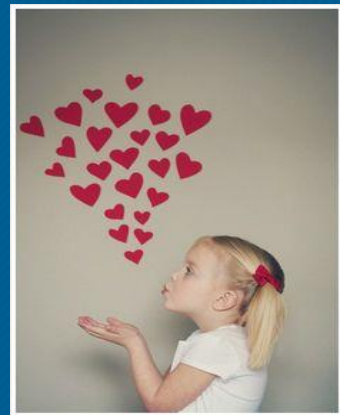
A cute valentine card to send