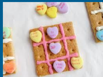
A valentine tic tac toe snack